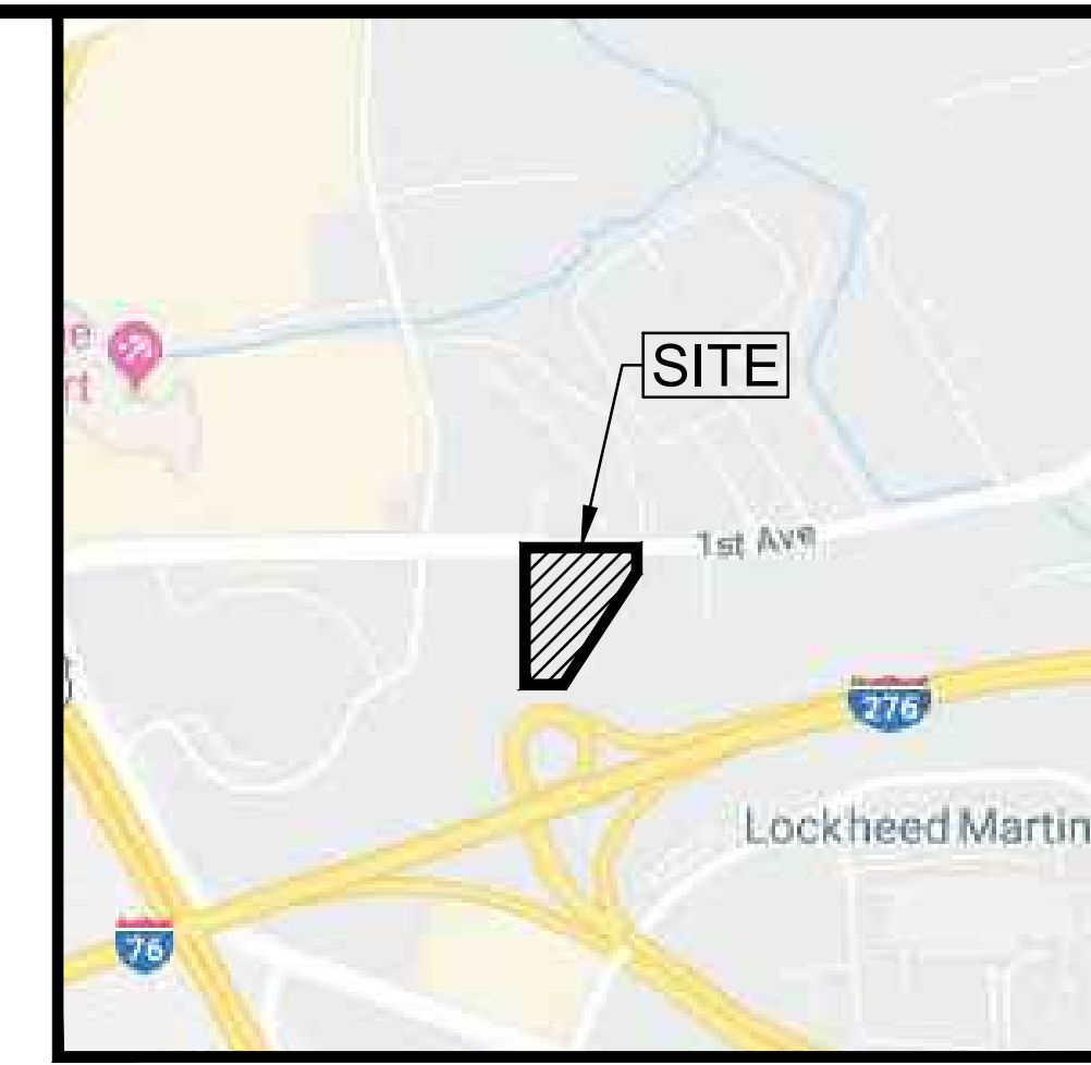
LOCATION MAP 1"=800'