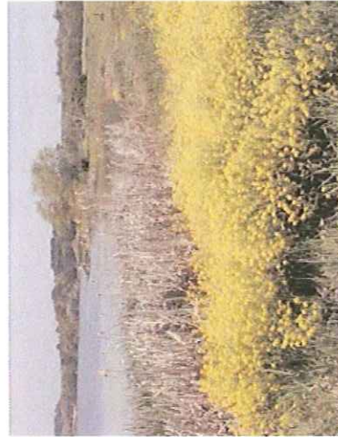
Riparian buffer strips of vegetation along a shoreline is key to protecting the pond from the intrusion of Canada geese.