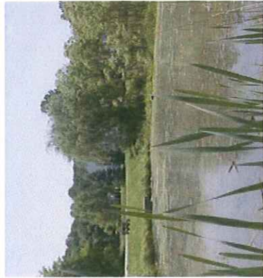
Stormwater retention basin (pond) integrates access for pedestrians as well as providing vegetation along the shoreline.

Goal 5 of the Watersheds plan is to "Reduce Stormwater Runoff and Flooding." Several objectives have been established to meet this goal. The ultimate and collective purpose of these objectives is to accommodate planned growth in a manner that protects public safety while sustaining ground water recharge, stream baseflows, stable stream channel processes and geomorphology conditions, the flood carrying capacity of streams and their floodplains, and ground water and surface water quality—to the maximum extent practicable. This can be accomplished through municipal implementation of "effective stormwater management," which includes ten principles.