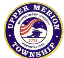
BANNER DESIGN EXAMPLE

For questions or more information on the Upper Merion Township Hometowns Heroes Banner Program, please call the Township Administration Office at 610-265-2600 x1229 or email gvattimo@umtownship.org .